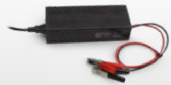
→ 26758 Charger for batteries from 12 V / 8 A / 96 W