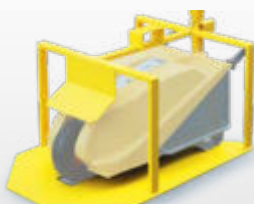
→ 41186 Protection cage for Tempo box