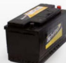
→ 1992 Battery 12 V 100 Ah