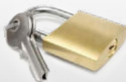
→ 12257 Padlock